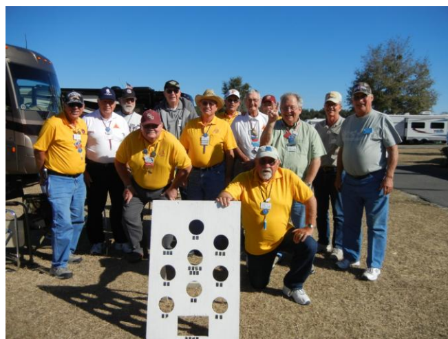
Okay – here's the real picture of the men's winning baseball team!