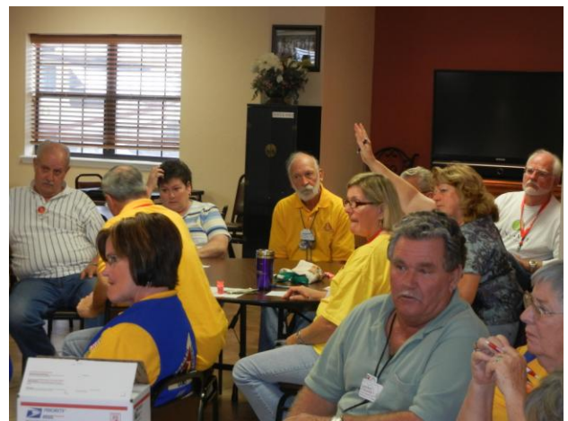
New officers lead the meeting ... and the group responds