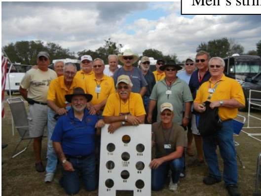
Men’s string of baseball wins continues!