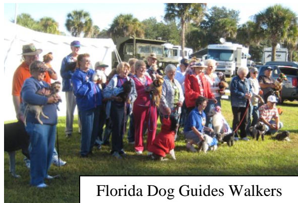
Florida Dog Guides Walkers