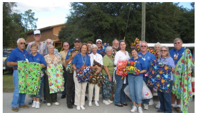
Delivering bears & afghans to Boggy Creek