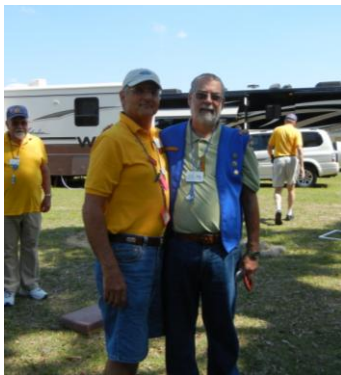
Champs & Runners-Up!