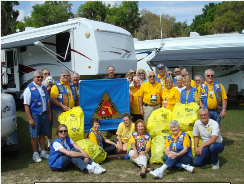
GT Sams got an early start for Clean Up Day!